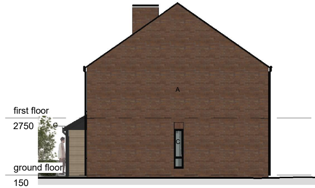
Side Elevation (right)